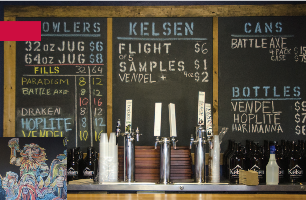
Kelsen Brewing Company