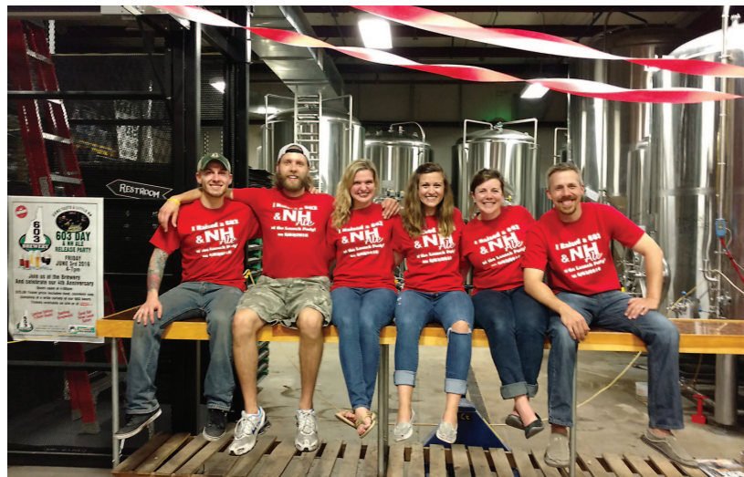
603 Brew Crew

As you drive south on Rt 93, you'll want to get off at exit 5, go left off the ramp to the third traffic light and go left. Down there, you'll find 603 Brewery , 12 Liberty Dr #7, Londonderry, where you can take a tour of the facility and try any (or all) of their ten taps of delicious beer. Each of their beers is named for landmarks of NH such as Winni Amber, White Peaks, 18 Mile Rye (our coastline miles) and so on. They offer cans, growlers and 603 gear to proudly wear after your visit. This 15 barrel brewery has only been in operation for about 4 years but has an aggressive market share in both NH and Massachusetts. Learn more at 603brewery.org