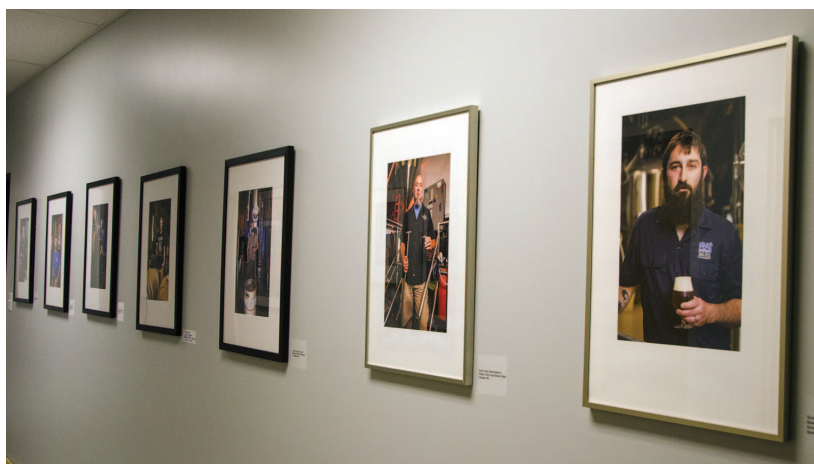
Picture Wall at Great North Aleworks