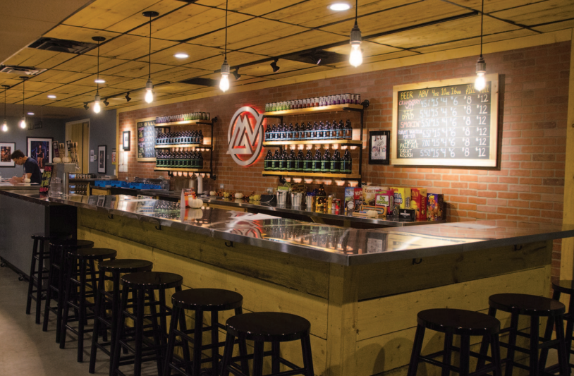
Great North Aleworks Bar Area

Strange Brew Tavern , 88 Market Street, Manchester has well over 70 taps, huge pub-style food menu, and nightly entertainment. Look up their extensive food and beer menus online at strangebrewtavern.net